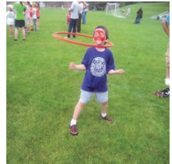
Despite the weather, over 300 guests enjoyed the games, food and fun at the Bethel Education Foundation's 1st Annual Family Summer Kick Off on June 22nd at Rockwell School.

The sky was dark and showers were in the air but that did not stop more than 300 people from kicking off their summer vacation with The Bethel Education Foundation. The first annual Family Summer Kick Off, held Wednesday, June 22nd on the grounds of the Anna Rockwell School raised more than $3,500 for the Foundation. Highlights of the event included food, games, raffles and much more. "A